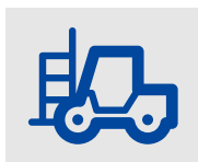
Empty container handler